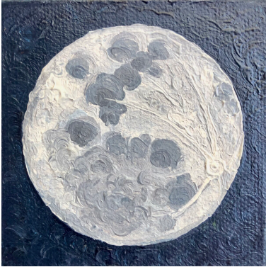
Acrylic on canvas